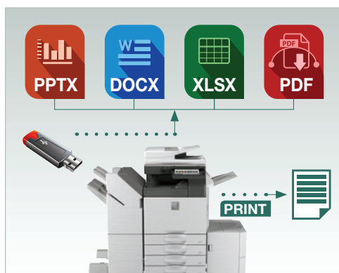
Direct print to popular file formats seamlessly with Sharp's available Direct Print Expansion Kit. 1